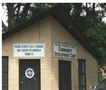
Pearl Street Community Development Corporation, Inc.